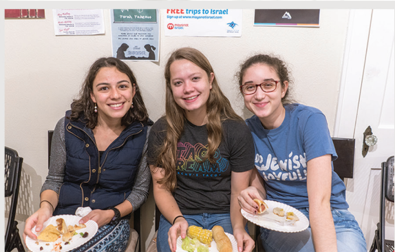
I didn't know any Jews. You introduced me to my community.