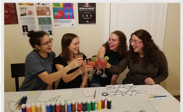
I needed a Jewish outlet. At 'Girls' Night In', no topic is off limits.