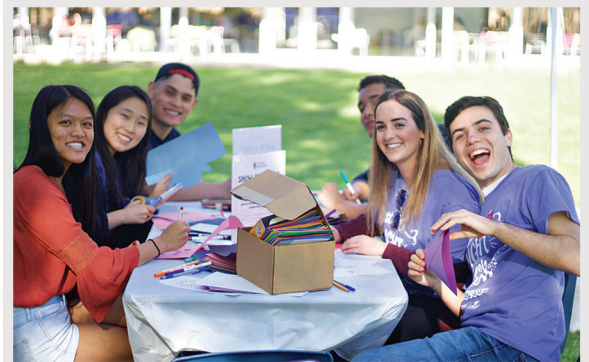
I was unsure how to give back. You gave me the Mitzvah Marathon.