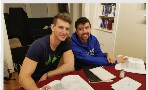
I had real questions about Judaism. Sinai Scholars gave me answers.