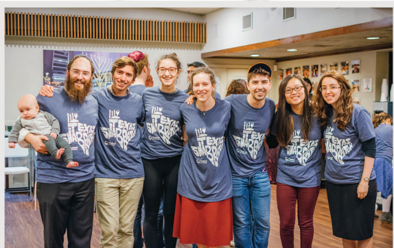
Judaism felt stale. Until I spent Shabbat connecting & learning.